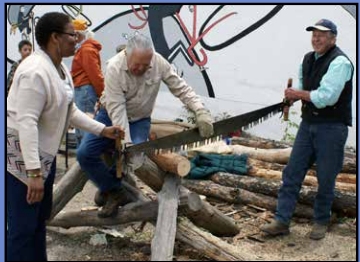
The local Forest Service teamed up with Backcountry Horsemen - Gila Chapter for cross-cutting and branding (outdoor arts & crafts!) at Saturday's Base Camp expo.