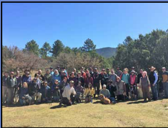
Sunday morning's community hike on Gomez Peak brought locals and thru-hikers together for an educational stroll and a very scenic Q&A.