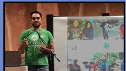
Two days of presentations and seminars covered everything from backcountry safety and navigation, to the public lands transfer and the challenges faced by women and minorities in the outdoor community.