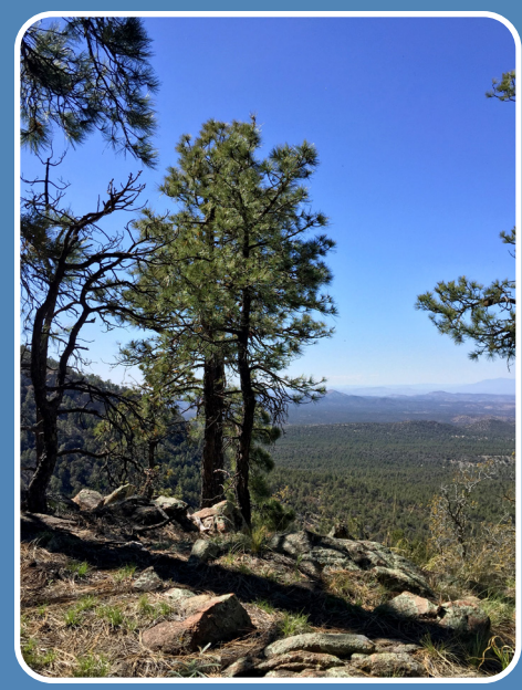
THE VIEW NORTH OF BURRO PEAK.

Trek across the landscape that inspired the prehistoric Mimbres Indians, whose artistic culture flourished until about 1150 A.D. and where struggles between Apaches and Buffalo soldiers marked the period from 1868 until the capture of Geronimo in 1886. This hike can be done as an out-and-back or 8-mile hike from Burro Peak Trailhead to C-Bar Ranch Road with a car parked at either end.