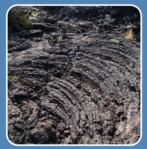
A COOLED LAVA FLOW IN EL MALPAIS NATIONAL MONUMENT.

Length: Variable (5 - 10 miles) Difficulty: Moderate