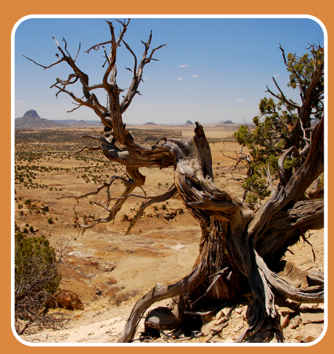
THE VIEW FROM CUBA MESA.

Length: 7 miles Difficulty: Moderate to Difficult