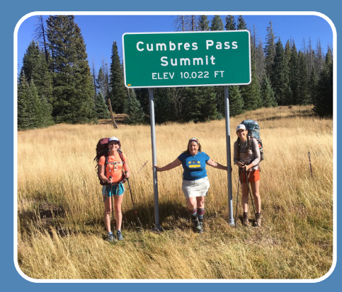
SUMMIT OF CUMBRES PASS.

Experience the West's great railroad history firsthand! Take a ride from Antonito, CO, to Cumbres Pass just north of the Colorado-New Mexico border on the historic Cumbres & Toltec Scenic Railroad, then hike on the CDT. If you're not riding the train, park at the spur to the south of the train station - the CDT leaves from the parking lot. Heading north, you'll gradually climb through open, grassy meadows and cool subalpine forest with fantastic views of the surrounding mountains. You'll encounter a 25 foot waterfall at mile 2.8. About 1.7 miles after, you'll reach a long, prominent ridge at 11,000 feet. The trail follows this ridge north through spectacular mountain scenery, but this is a good turnaround spot and picnic site with a view of the Rio Chama Valley below.