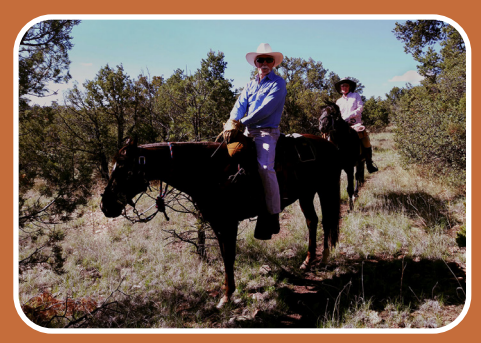
A RIDE ON THE CDT NORTH OF HWY 35.

Length: Variable (5 - 12 miles) Difficulty: Easy