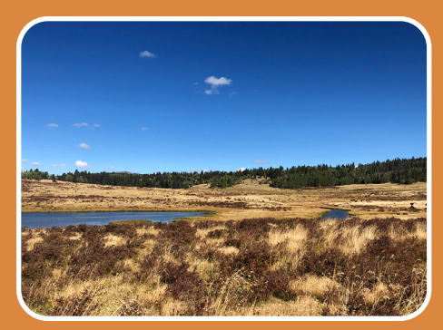
ON THE CDT NEAR HOPEWELL LAKE CAMPGROUND.

Length: Variable (1 - 14 miles) Difficulty: Easy to Moderate