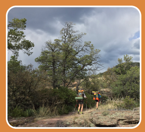
ENJOYING LITTE WALNUT TRAIL. PHOTO BY JOHNNY CARR

This trail offers an easy opportunity to experience the CDT. There are a few spots that are a bit rocky and a couple short uphills, but overall this section of the CDT is a good hike for any skill level. Heading north on the CDT, you will find a green gate about 1.5 miles from the trailhead. This is a great place to enjoy the view and stop for a snack!