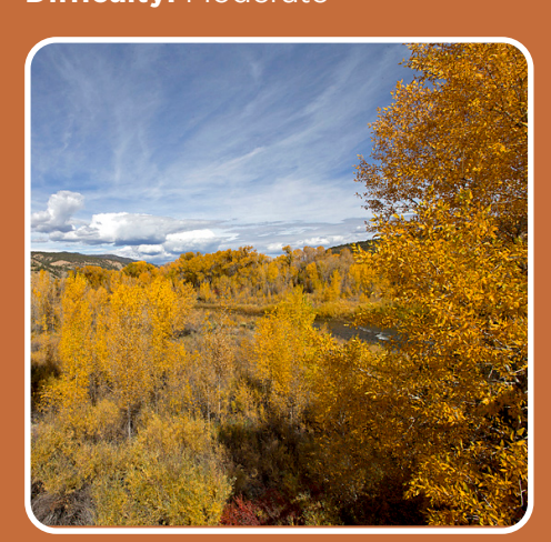
FALL COLORS NEAR THE RIO CHAMA.

Length: Variable (1 - 10.7 miles) Difficulty: Moderate